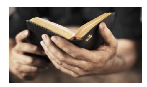
Excerpts from the English translation of the Roman Missal © 2010, International Commission on English in the Liturgy (ICEL) Used with permission. All rights reserved

(R.) Praise the Lord who heals the broken-hearted.